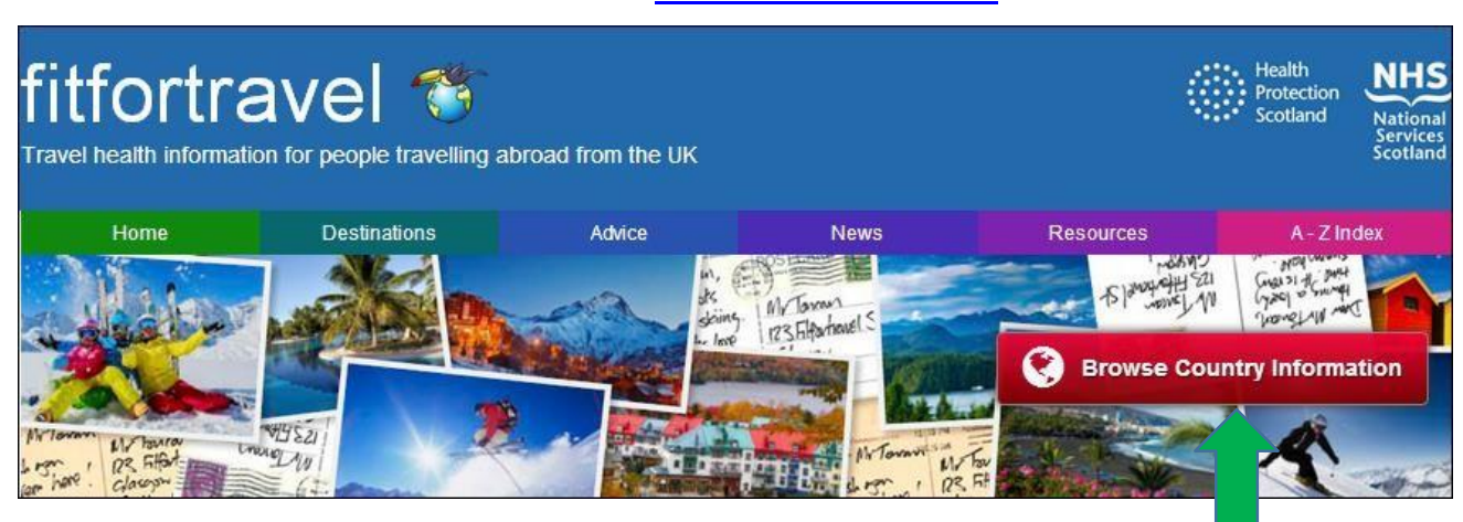
The website is www.fitfortravel.nhs.uk

Are you planning to travel to one or indeed many countries on your trip which are in malarious areas? We would ask you to go to a useful NHS website and look up all the destinations you are visiting, print out the malaria maps for the country or countries, then mark on the map(s) where exactly you are travelling to. This will then enable you to see your risk more clearly and help us to identify your risk within your travel appointment so that we can decide the most appropriate drugs for you specifically.