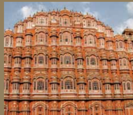
Hawa Mahal, the Palace of Winds

We can't wait to go back: there is so much more to experience and next time we won't leave it so long.